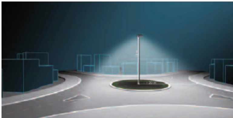
Roundabouts with central lighting